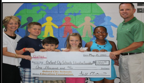
Gallet-Terracon Co. presents $1000 check to OCSEF

BBVA Compass Cider Ridge Development Cider Ridge Homes Design World Energen Corporation ERA King Real Estate NobleBank & Trust Protective Life Webb Concrete & Building Materials