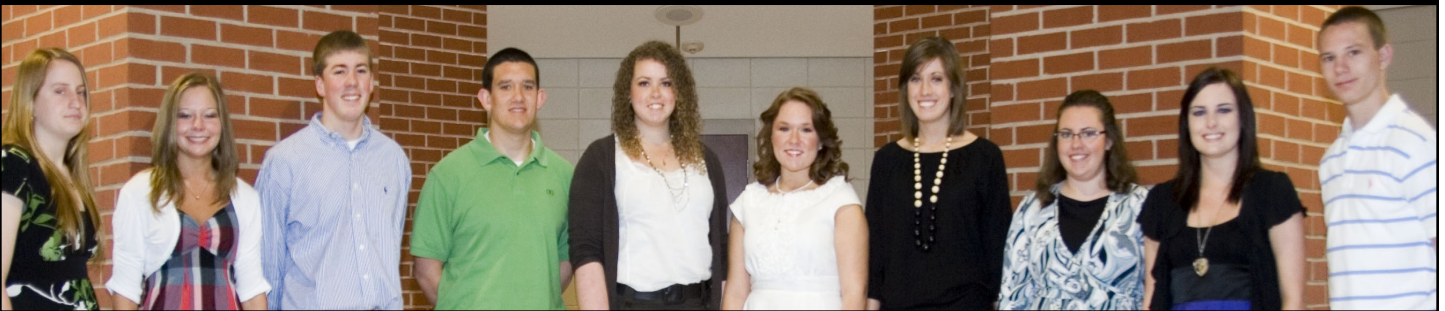
Oxford High School's Class of 2010– Top Ten Students